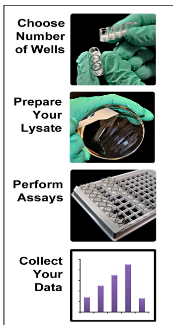
Figure 1: Simple and Quick Protocol